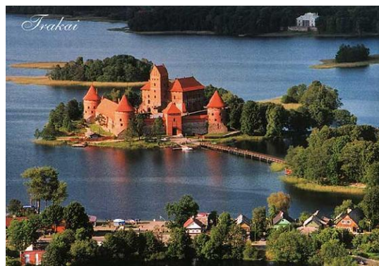
Excursion to Trakai