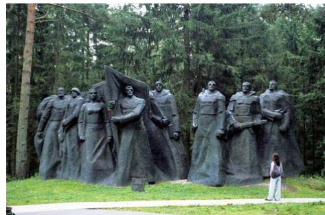
Excursion to Soviet sculpture exposition Grutas park http://www.grutoparkas.lt/